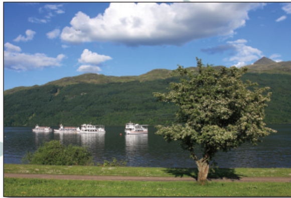
Cruise ships. Moored off the village of Tarbet on Loch Lomond's western shore, these vessels provide a variety of cruises around the loch.