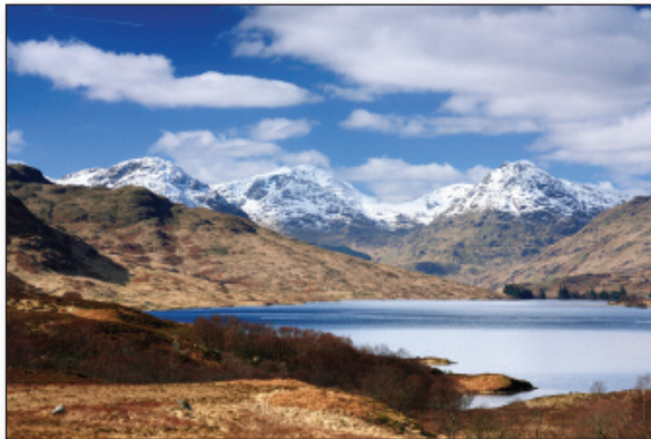
Loch Arklet. This stunning panorama awaits as you reach Loch Arklet, with views from left to right of A' Chrois (848m), Beinn Ime (1011m) and Ben Vane (915m).