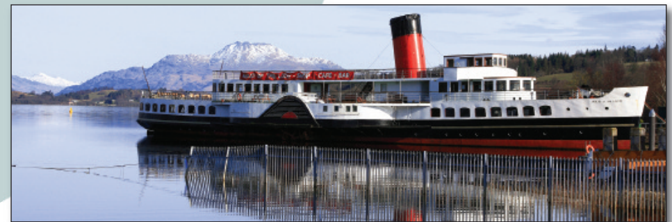
Loch Lomond at its best. The Maid of the Loch, snow on Ben Lomond, the still blue waters of Loch Lomond itself, and Balloch Castle Country Park just visible on the right.