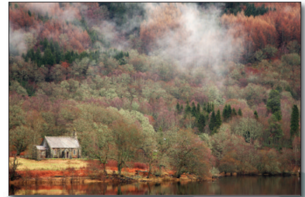
Trossachs Church. The Church of Scotland serves the Congregation of Callander Kirk in the most delightful setting imaginable, perched on a small shelf between this colourful Trossachs hillside and the still waters of Loch Achray.

Loch Long and The Cobbler South of Arrochar, as the road to Loch Lomond climbs up towards Glen Douglas, it affords a sweeping view over Loch Long and the mountains beyond, including from right to left A' Chrois (848m), Beinn Narnain (926m) and The Cobbler (884m) or Ben Arthur to give it its proper name.