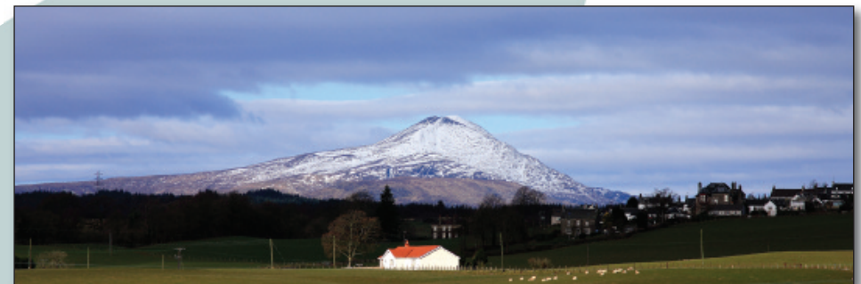
Ben Lomond from the south east. One of the most open vistas of Ben Lomond can be had from just south of Aberfoyle.